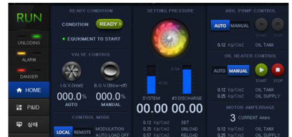
Machine safety logics and self diagnostic functions