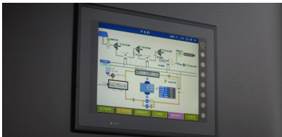
Easy to see monitoring with High definition LCD touch screen