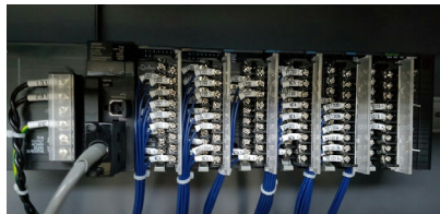
Optimal operational logics with varying required air guaranties : PLC based controller